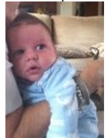
Cooper snuggled up