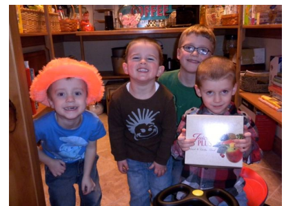
Doc's grandchildren peddling the new Juice Plus Gummies (for kids and adults).